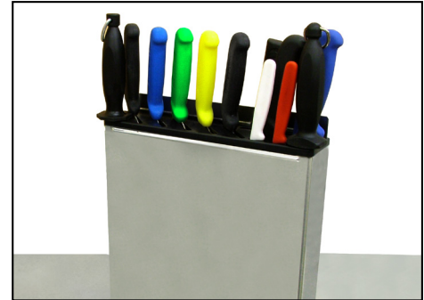
Knives not included